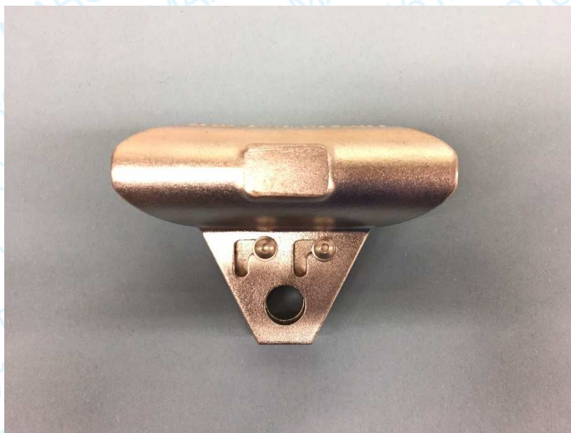
Figure 1 – Anchor device described as “HS-01”

Samples were tested as received, and were not subject to any pre-conditioning processes other than those stated in individual test clauses